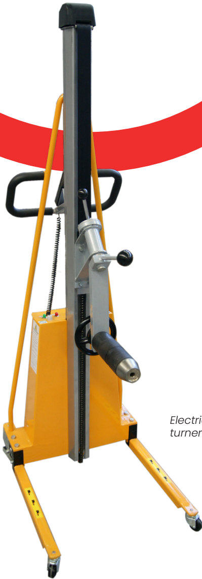
Electric version with reel turner accessory

The battery 24 V-12 Ah. maintenance free, combined with a robust motor and electronic control with overload protection ensures safe and reliable operation. The battery charger is integrated.