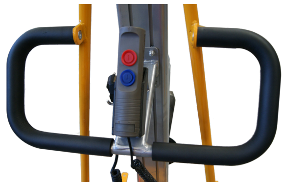
Wired control (standard)