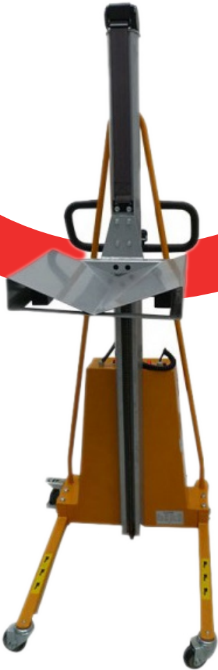
"V" shaped tray 400x400mm