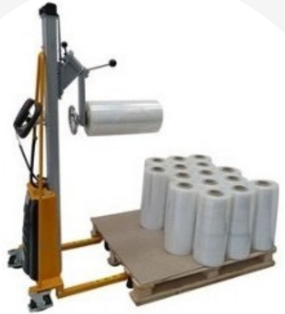
Reel turner for "3" cores max weight 50kg max diam 550mm max height -300mm