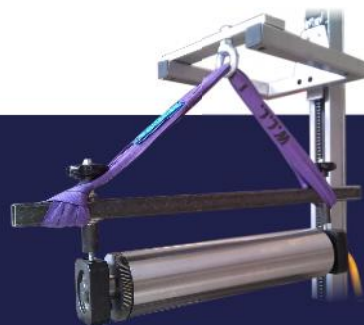
Magnetic cylinder holder