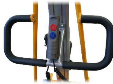
Wired remote control