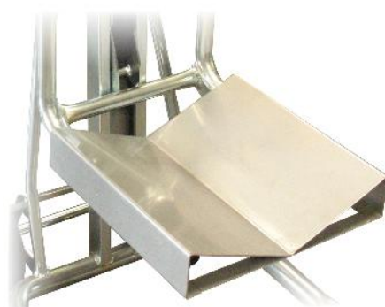
"V" shaped tray