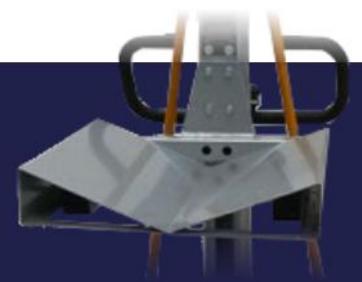
"V" shaped tray