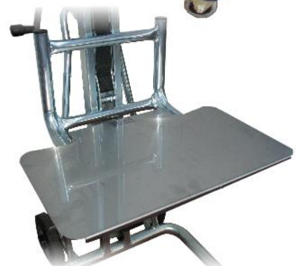
Flat foldable tray