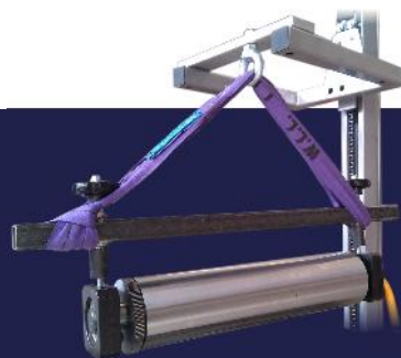
Magnetic cylinder holder