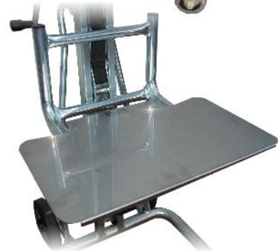
Flat foldable tray