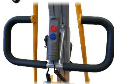
Wired remote control